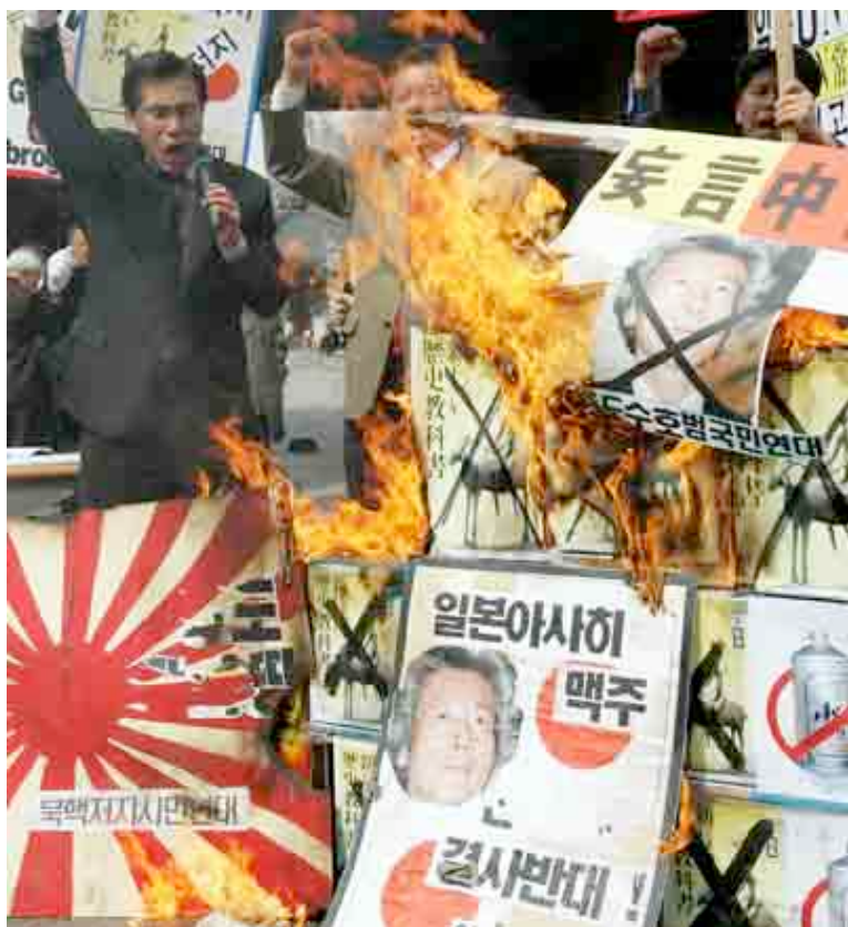
South Korean protesters burn banners during 2005 demonstration over Japanese textbook distortions

The Japan Teachers Union denounced the book published by Fusosha, and only 18 out of 11,102 junior high schools adopted the book, taking up only about 0.04 percent of the total market share. Despite Beijing and Seoul's persistent protests, the market share of "problematic" texts has been consistently dismal.[26]