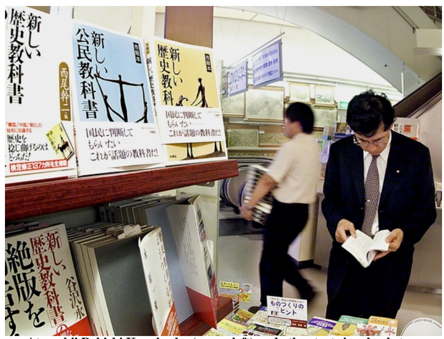
Atarashii Rekishi Kyoukasho (upper left) and other texts in a bookstore

The saga continues in the twenty-first century. Following Education Ministry's approval of the New Japanese History (Atarashii Rekishi Kyoukasho) authored by Tsukurukai in April 2001, China and Korea demanded revisions of the text, but to no avail. China Radio International, as an example, reported on the Beijing government and the Chinese people's strong dissatisfaction with the new Japanese history textbook.[25] The controversies continued the following year when a Chinese newspaper report linked Japanese corporations to Tsukurukai. Chinese consumers launched boycotts of the companies linked to Tsukurukai. Amid the mass protests led primarily by the youth, Asahi Breweries became the first target of boycott. The 2005 clashes were, again, the result of Chinese and Korean protests against the New Japanese History (Atarashii Rekishi Kyoukasho), which was accused of downplaying the nature of Japan's militarism including its past aggression and the circumstances of World War II.