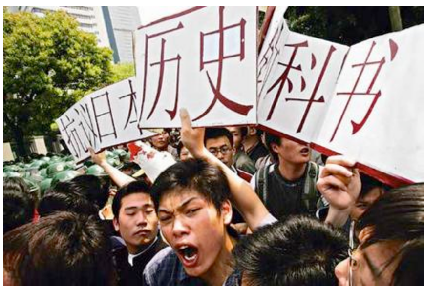
Shanghai 2005 protest over Japanese textbooks

teachers, experts and ordinary citizens who provide advice and consultations to the board of education. After holding public textbook exhibitions and internal discussions, the committee selects the textbook to be adopted for the school district.[28] An analysis of thirty-three junior high school history textbooks (1950-2000) shows very little narrative change over time.[29]