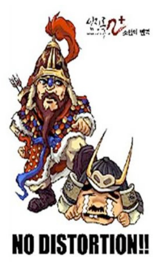
South Korean computer game[3]

History education in Northeast Asia needs to be contextualized within the context of regional and global expansion of mass education. With the spread of mass and compulsory education throughout the twentieth century, governments sought to control pedagogical content with education ministries frequently taking the lead.[4] Education is a "system of legitimization" wherein "schools process individuals" by instilling commonly shared values among the citizenry.[5] Whereas school and family long functioned as important socialization units, schools are now assuming a greater role in educating future generations.[6] Youth establishes self-identity in relation to group membership in classes and schools, where knowledge about national history is transmitted. Emile Durkheim led us to believe that "a man is surer of his faith when he sees to how distant a past it goes back and what great things it has inspired."[7] Remembering noble deeds, he said, elevates the community's dignity and moral values. In that regard, national history education is both a "model of" and "model for" society. The common past is the story of a nation, and history textbooks tell the story of a nation to its citizens. Overlapping histories make textbooks one important site where nations engage in "memory wars."