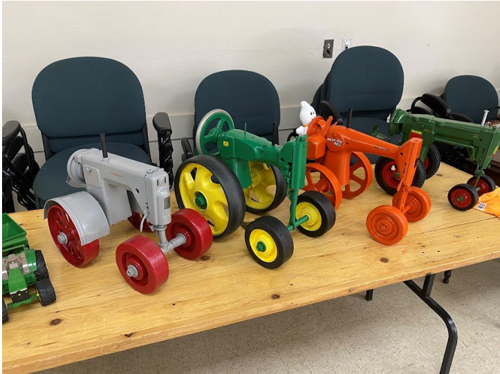
Displays at our Oct. 2023.