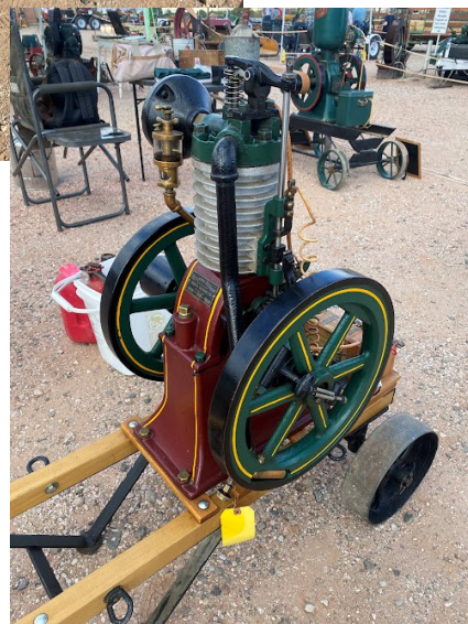
A number of engine displays this year.