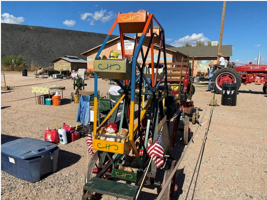
Outside engine display areas.