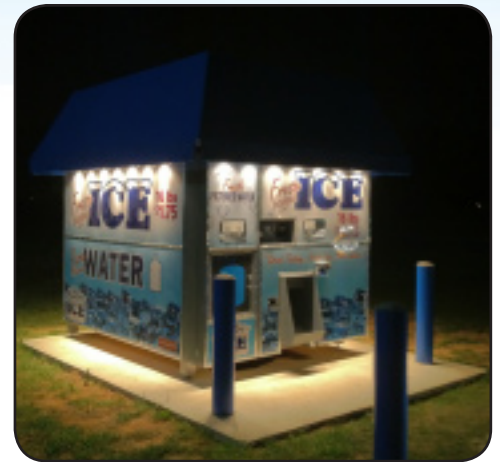
IM2500 shown with optional light kit

By design, the IM2500 is built to accommodate additional ice makers as your business grows. A second ice maker offers owners the opportunity to increase their recovery time during peak demand times, allowing the machine to keep up with even the highest demand locations. And because each ice maker can function independently, the owner can elect to scale back the number of ice makers producing ice, based on daily volume needs - which allows owners to manage operating costs more efficiently to MAXIMIZE PROFITS .