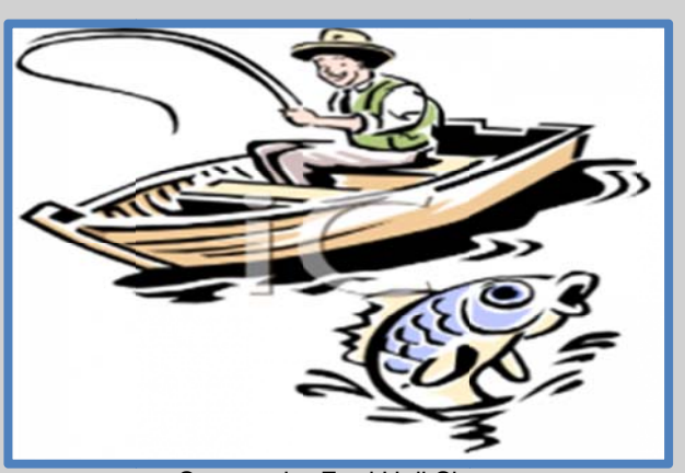
Seen at the Fred Hall Show