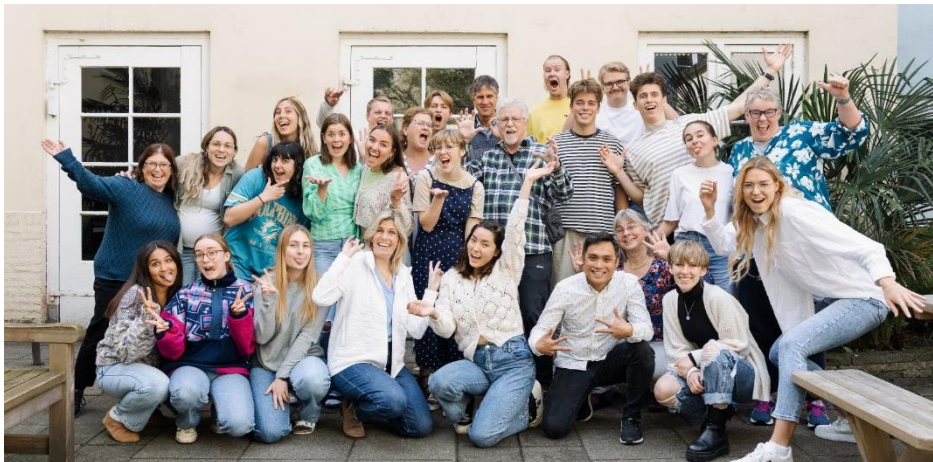
Here are my 25+ students in the Discipleship Bible School. They came from the Netherlands, Norway, Sweden, France, Germany, Switzerland, Canada, and the USA.

The second week, we changed departments. It often works best to lecture for two different schools with only a single plane ticket, and this was the case here, where I taught for a week in the Discipleship Bible School, covering the 7 th and 6 th century prophets of Israel. Again, my students, more than 25 of them, were from all