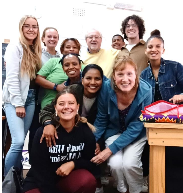
Here are some of my students coming from South Africa and other countries.

As usual, I had a variety of students, mostly from South Africa, but also some from England, Ireland, the Netherlands, Brazil, and one from western Michigan.