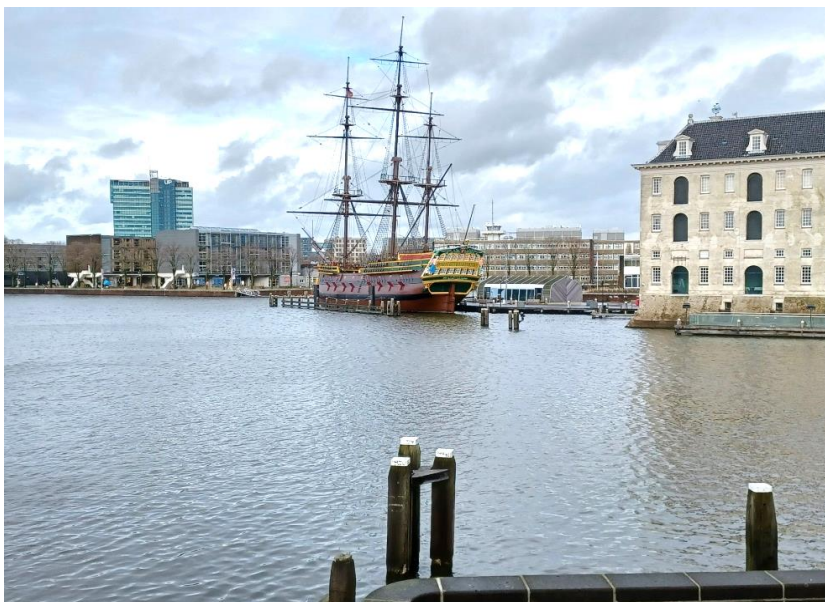
Standing in front of the four-story campus building of University of the Nations, this is the view of Amsterdam one sees.

The Netherlands are lovely in spring, and the School of Biblical Studies hosted our first week there, where I lectured on Jeremiah and the acrostic poems in the Lamentations.