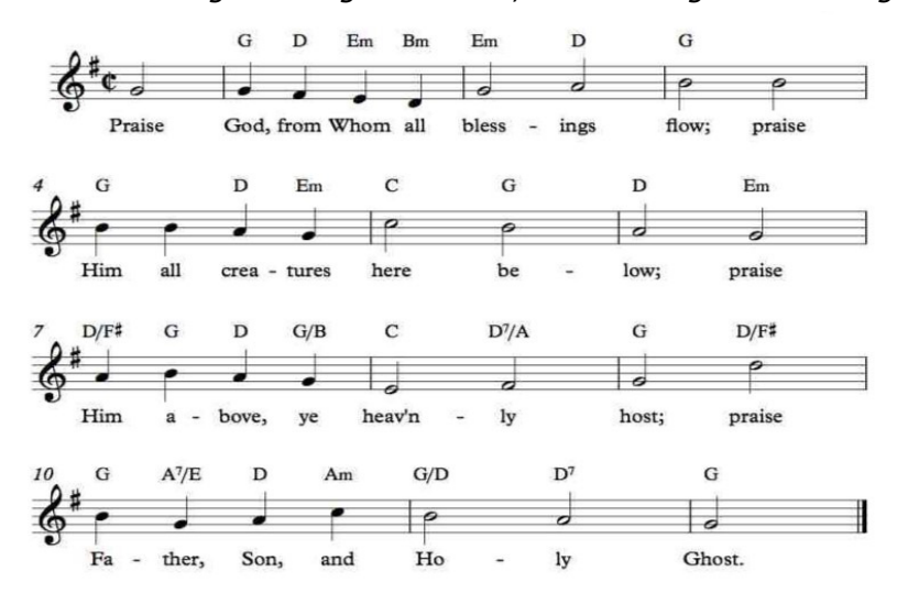
Doxology, written in England for Protestant Churches in 1674.

As the offering is brought forward, we will sing the Doxology.