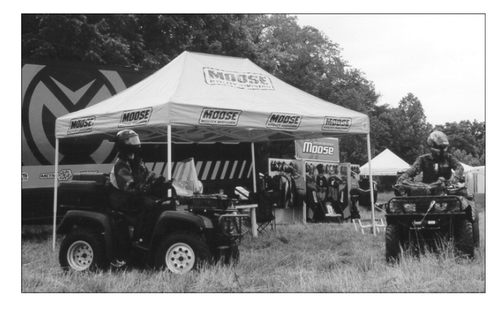
Moose Racing brought their truck to demo the goodies.

Everybody should work a race. First off, I was just standing there when the scoring offical from the circuit asked, "Who's going to run the computer?" Six people just turned around and looked at me. So, I got to run the computer for sign up and the race. Mostly, things went pretty smooth during sign (Continued on page 7)