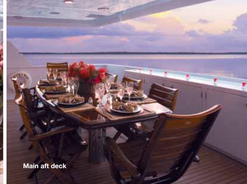
Main aft deck

“Anything that can go right will go right,” is Murphy's Law on this yacht. The antithesis of ordinary life, Murphy's Law is a paradisiacal self-contained world, catering to those desiring attentive service and a good time. The thoughtfully designed layout includes many convivial gathering spots from a sit-down bar in the main salon to a games table in the skylounge. It also allows guests the choice of dining alfresco on any of the three decks, or inside in formal elegance.