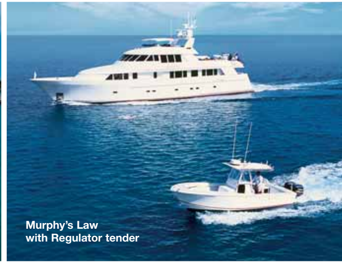
Murphy's Law with Regulator tender