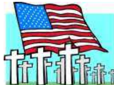
Remember – Memorial Day