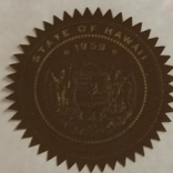
The 32nd Legislature Certificate No. 846