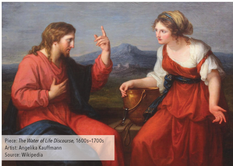
Piece: The Water of Life Discourse , 1600s-1700s Artist: Angelika Kauffmann