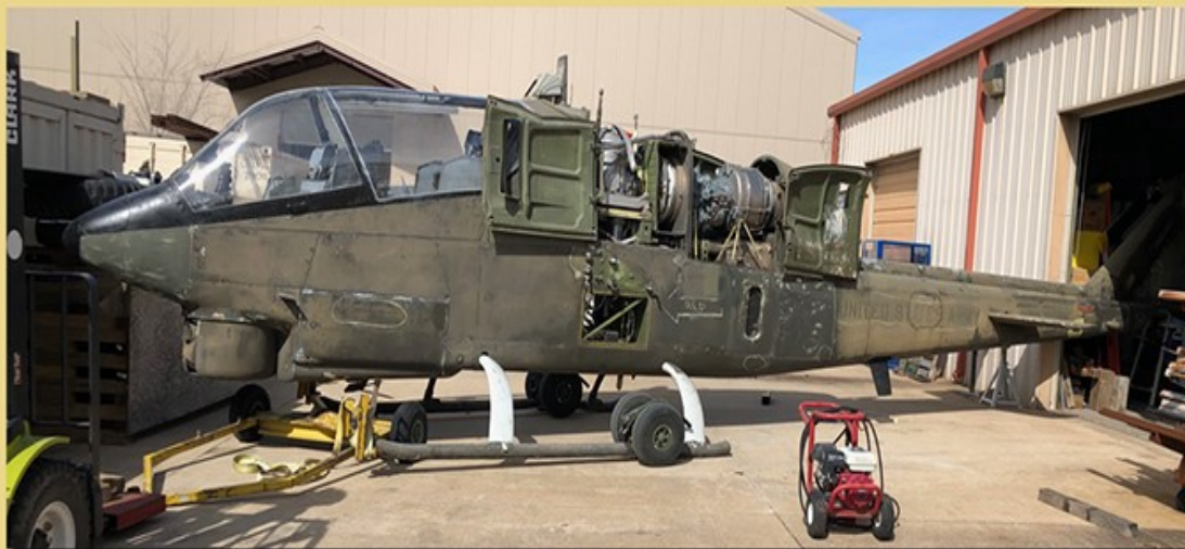
Cobra ready for its high pressure wash