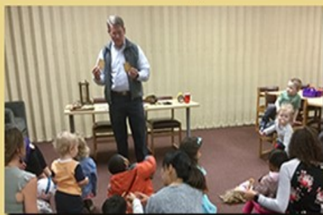
Colonial Hands-On program at the Nye Library

13 Mar. Revolutionary War Hands-On for Cache M.S. FA Museum