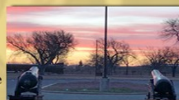
Basic Trainee dawn, 19 March

The focus this quarter has been refurbishment of the Vietnam War Cobra helicopter gunship and work on the Korean War diorama. These are the next two big pieces to be done in the new addition now that the Vietnam War diorama is finished.