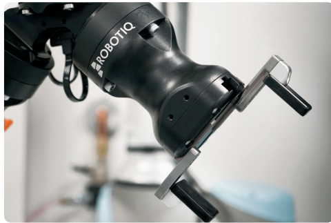
Extenders sold separately