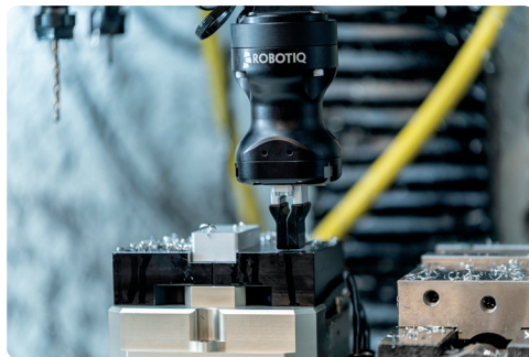
Force Copilot sold separately

ADAPT THE HAND-E TO YOUR PARTS WITH ACCESSORIES OR CUSTOM FINGERTIPS