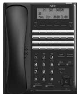
24 Button Digital Telephone