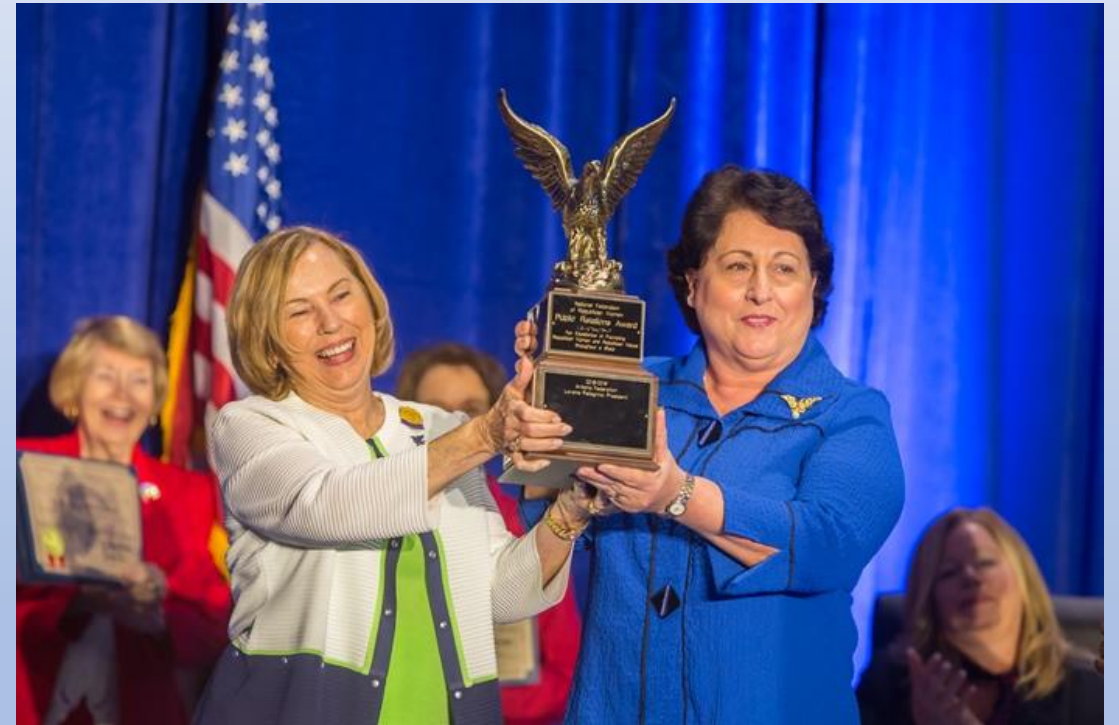
AzFRW earns the top Public Relations Award at the NFRW Biennial Convention in Indianapolis