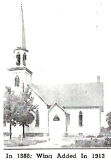
In 1888: Wins Added In 1913