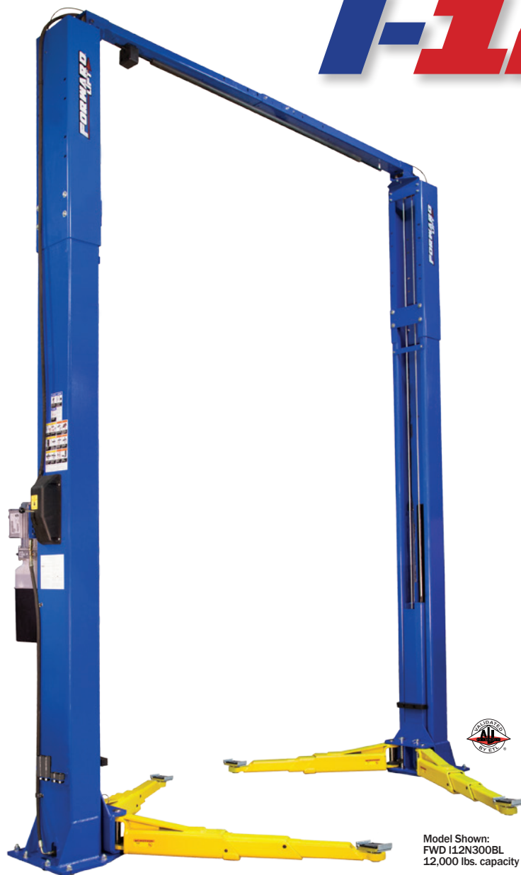
Model Shown: FWD i12N300BL 12,000 lbs. capacity