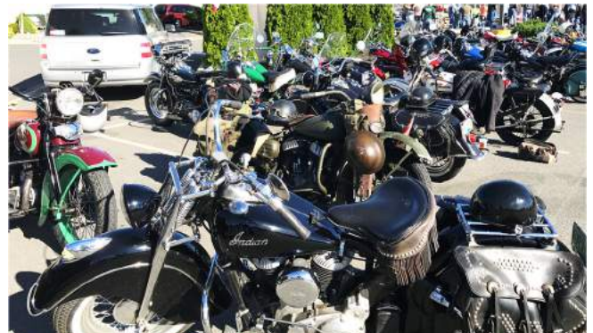
Bikes line up before a ride at the Evergreen National, Sequim, WA