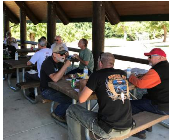
Lunch at the Fort Hoskins picnic shelter