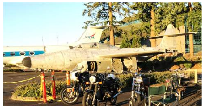
Vintage aircraft and motorcycles