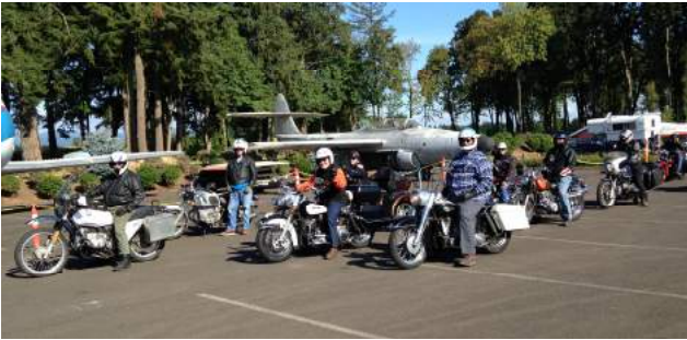
Line up before departure on Friday morning