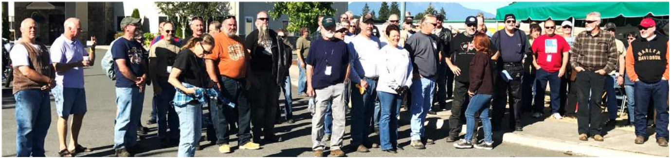
Participants assemble before a ride at the Evergreen National, Sequim , WA