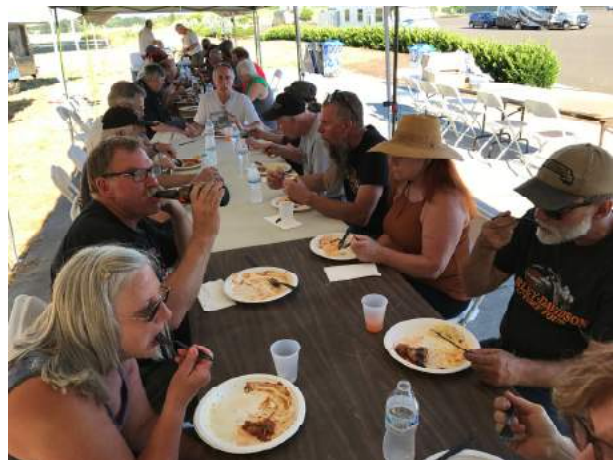
Saturday night's BBQ dinner