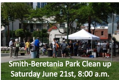
Smith-Beretania Park Clean up Saturday June 21st, 8:00 a.m.

P.O. Box 37764 Honolulu, HI 96837 Ph: 589-9927