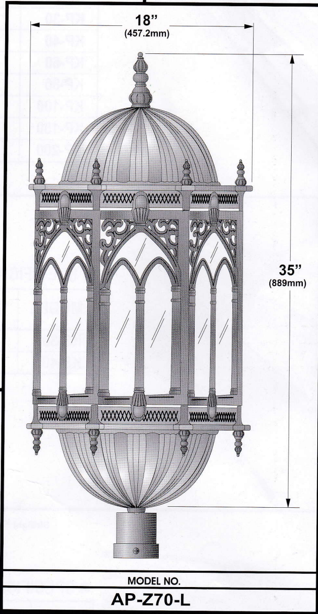
MODEL NO. AP-Z70-L