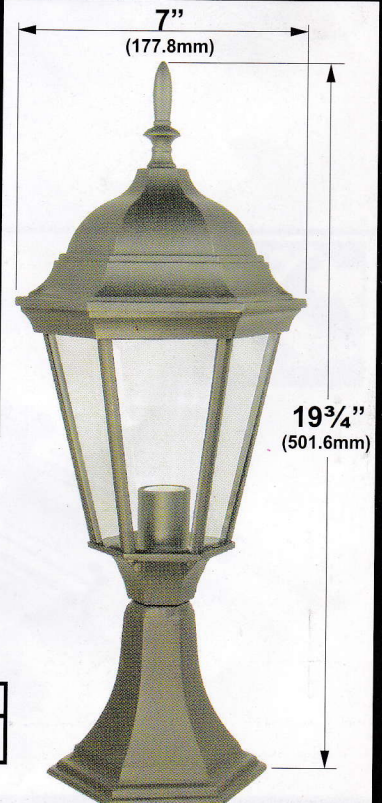
MODEL NO. AP-5124S