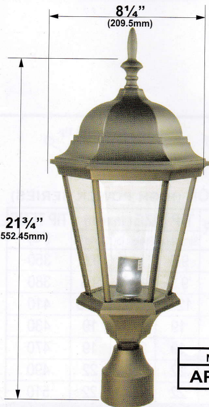
MODEL NO. AP-5123L