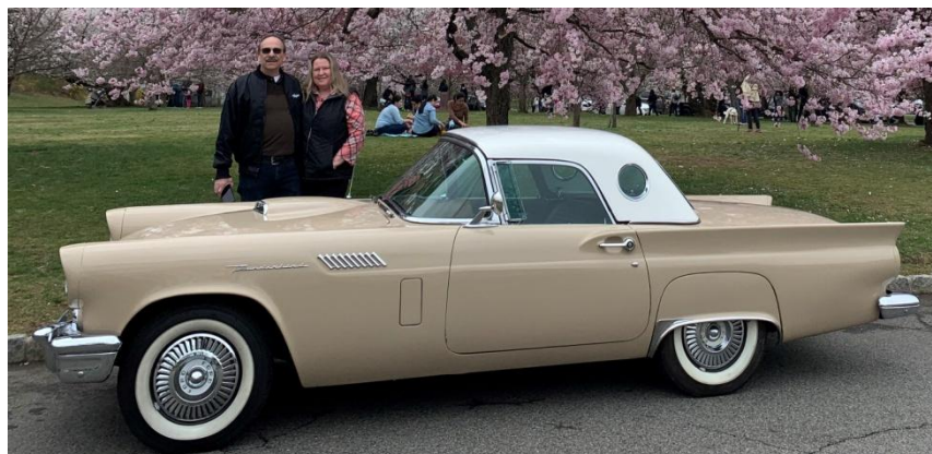
Mike Parillo's 57 E Bird (See Page 8)

Get the Birds out and ready for the good weather. As always, Stay Healthy and enjoy every day Pat LeStrange