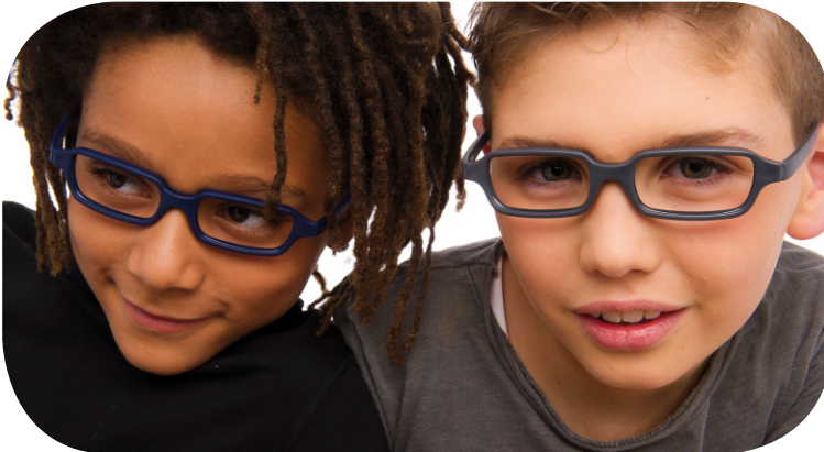
New Baby 4 47/17 Color: DS/J