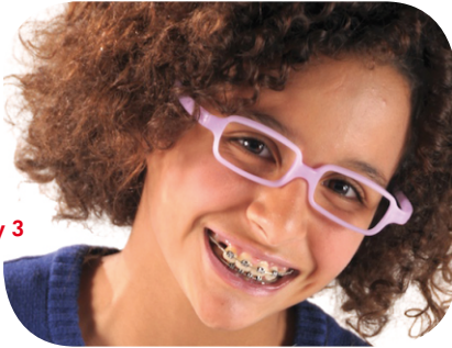
New Baby 3 45/17 Color: L