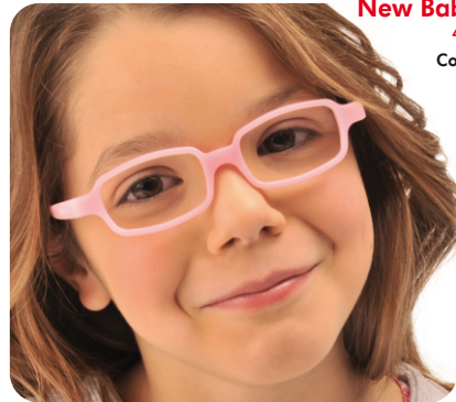
New Baby 2 42/14