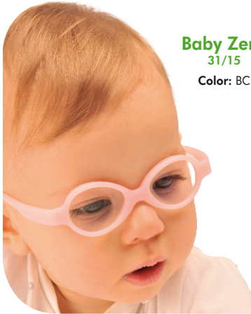
Baby Zero 31/15 Color: BC