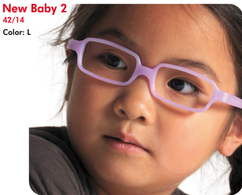
New Baby 2 42/14