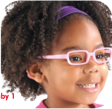
New Baby 1 39/14