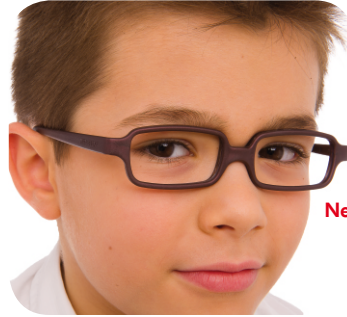
New Baby 3 45/17 Color: M