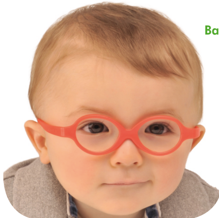
Baby Zero 2 34/15 Color: IP