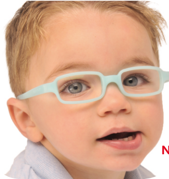
New Baby 1 39/14