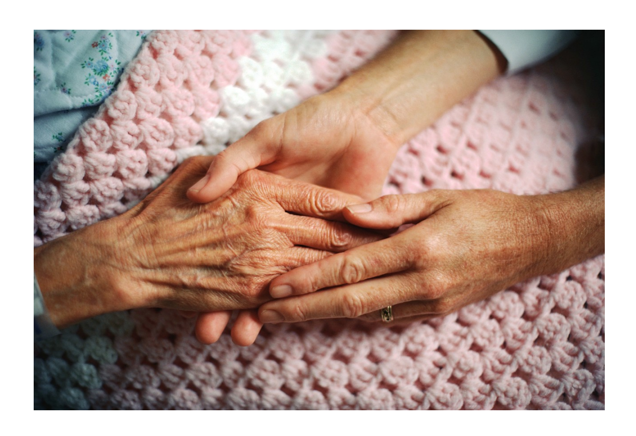
Finding & Employing a Home Care Provider

In-Home Supportive Services Recipient Handbook