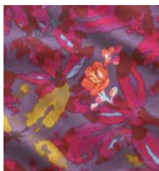
Vibrant colors with SEFAR® PET 1500 140/355-34Y