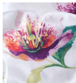
Intensive colors on silk with SEFAR® PET 1500 150/380-31Y