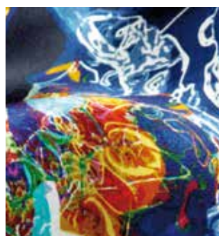
Fine details and colors on silk with SEFAR® PET 1500 120/305-34Y