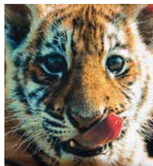
Applications of glitter with SEFAR® PET 1500 24/60-140W