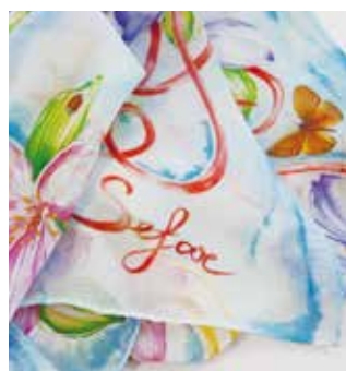
Fine details with SEFAR® PET 1500 100/255-40Y

Enchanting materials, unique design, colors without equal: Fashion in the sophisticated set plays impressive, elegant and refined games with our senses. Along the way, the choice of the right screen printing mesh is crucial. Should the front and back of the fabrics look identical? Does a designer want special effects? The more complex the task, the more certain it is that there is only one easy-to-use solution: Screen printing. SEFAR® PET 1500 wins hands-down with its value-for-money and ideal properties, when used in standard applications up to exclusive special printing.