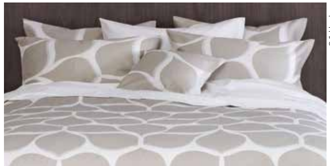
Fine details with SEFAR® PET 1500 100/255-40Y