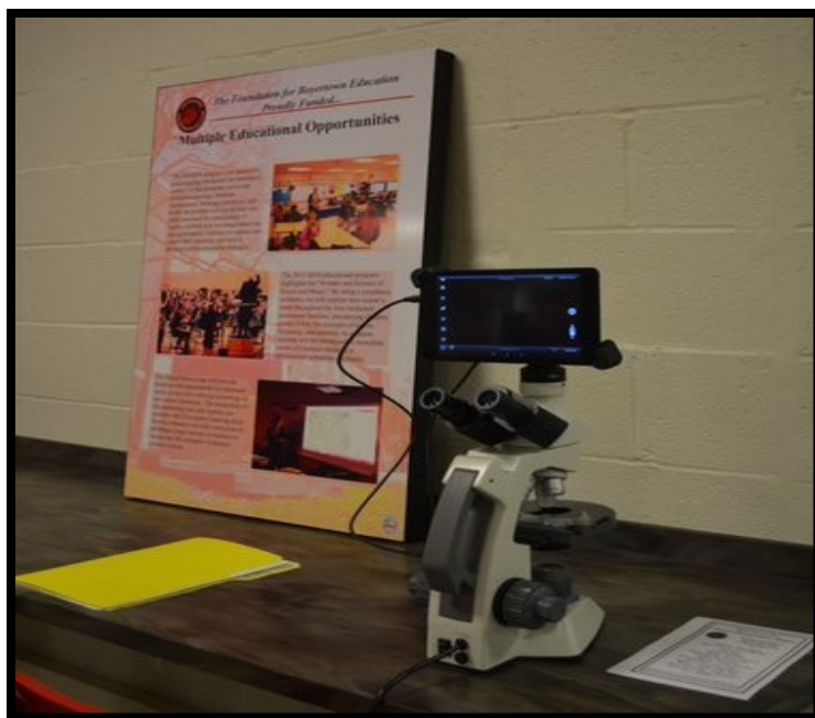
Digital Microscopes ensure that students are seeing what the teacher is displaying. They can see the slide on a large screen or on their laptop or iPad.

Your generosity continues to make this program a possibility.