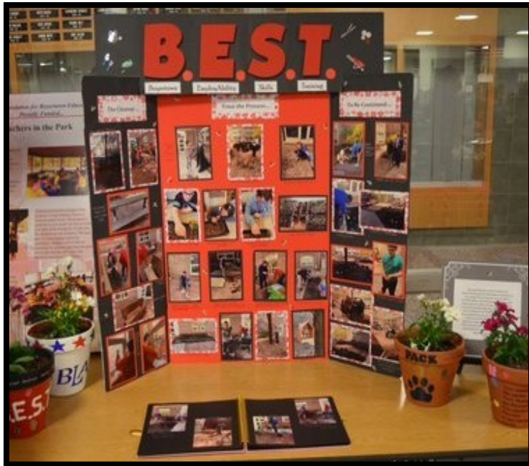
Boyertown's Employability Skills Training Program benefits the community, preparing students for the workforce.