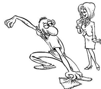
SNAKE CREEPS DOWN