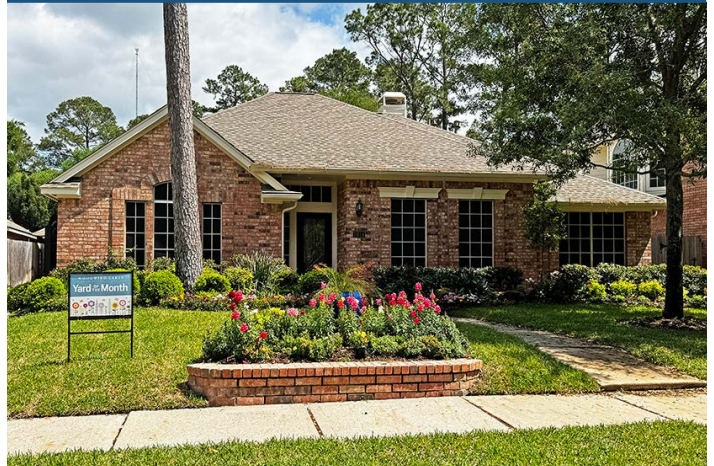
7914 ALLEGRO DRIVE