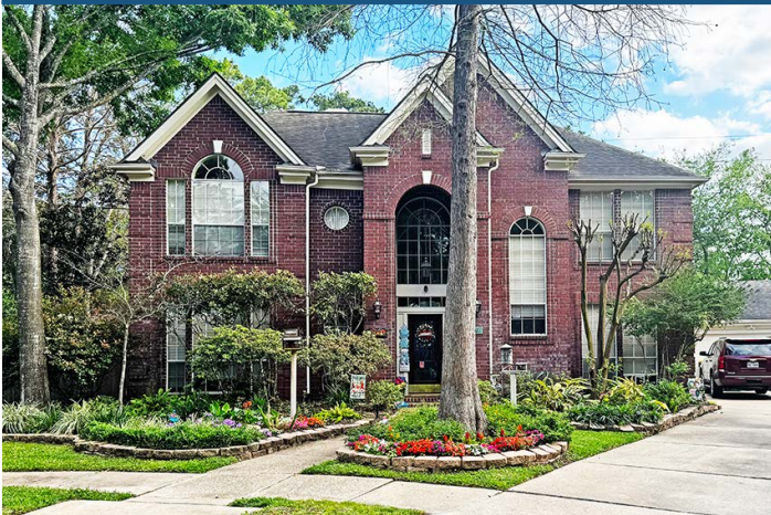
9231 BRAHMS LANE