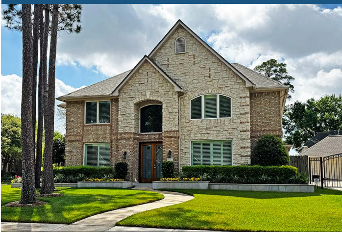
8703 GOLDEN CHORD CIRCLE