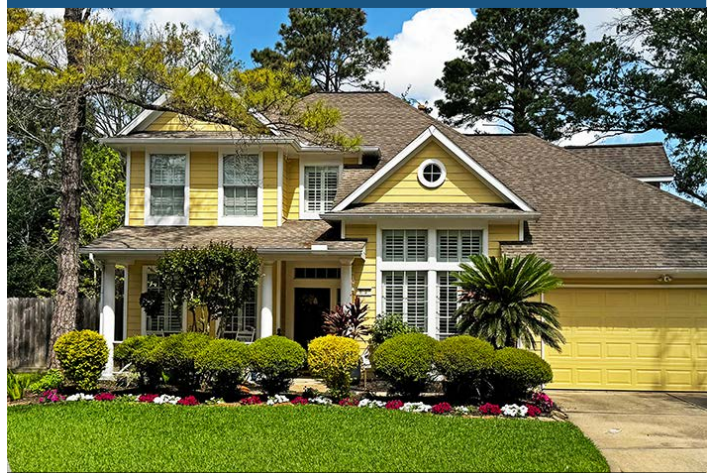
8107 RONDO COURT

Congratulations! And thanks for keeping our community looking its best!