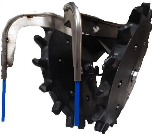
RMTKZ R & L