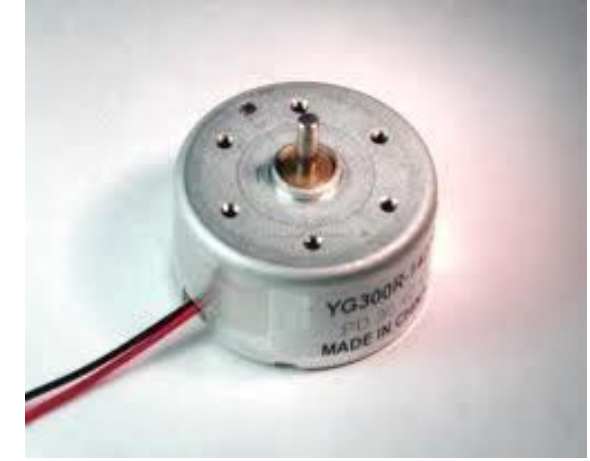
Fig.2: DC Motor

DC engines are arranged in numerous sorts and sizes, including brush less, servo, and apparatus engine composes. An engine comprises of a rotor and a changeless attractive field stator. The attractive field is kept up utilizing either changeless magnets or electromagnetic windings. DC engines are most regularly utilized in factor speed and torque. Movement and controls cover an extensive variety of parts that somehow are utilized to produce as well as control movement. Regions inside this class incorporate direction and bushings, grips and brakes, controls and drives, drive parts, encoders and resolves, Integrated movement control, restrict switches, straight actuators, straight and rotating movement segments, straight position detecting, motors(both AC and DC engines), introduction position detecting, pneumatics and pneumatic segments, situating stages, slides and aides, control transmission(mechanical), seals, slip rings, solenoids, springs.