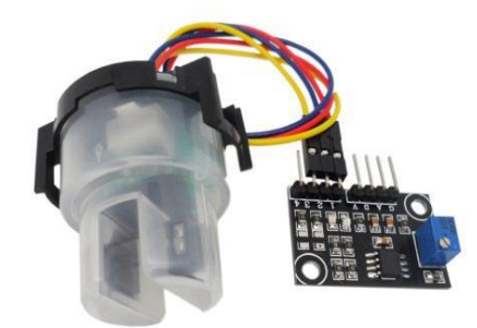
Fig.4: Turbidity sensor

Turbidity is a measure of the cloudiness of water. Turbidity has indicated the degree at which the water loses its transparency. It is considered as a good measure of the quality of water. Turbidity blocks out the light needed by submerged aquatic vegetation. It also can raise surface water temperatures above normal because suspended particles near the surface facilitate the absorption of heat from sunlight.