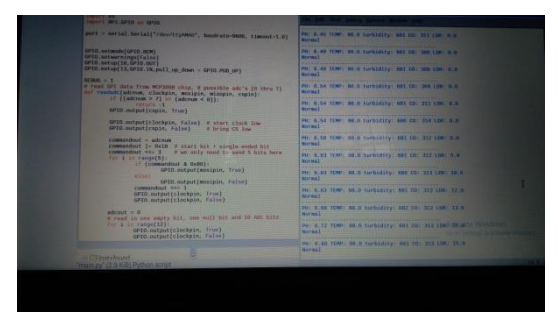
Fig.7: Resultant sensor values of pH, turbidity and co2