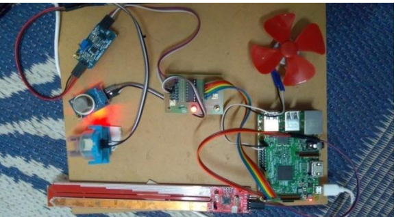
Fig.6: Hardware Design