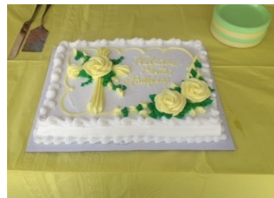
Traditional Reception Cake