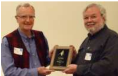
Ewing Row Photographer of the Year