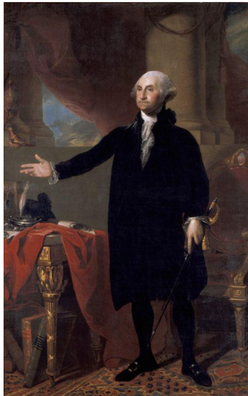
The 1797 Gilbert Stuart painting of President George Washington

"Afterwards newspapers circulated a report that Dolley Madison had personally saved Gilbert Stuart's portrait of George Washington, a story that revived patriotism and support for the war. The tale, lauding the First Lady's quick thinking in a moment of crisis, eventually found its way into American folklore through schoolbooks, monographs, and artwork. She repeated the story frequently for the rest of her life, reminding listeners of her bravery and love of country.