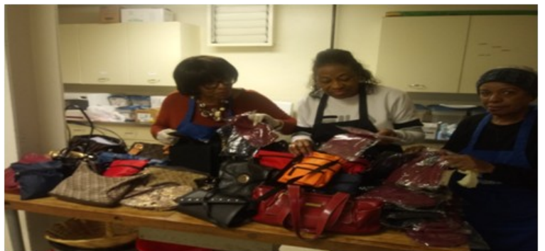
Illiana Club members preparing display of purses filled with toiletries, hats and gloves for the women.