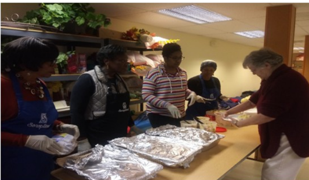
Illiana Club members preparing plates for families.

On Tuesday, October 29, 2019 we provide a meal for approximately 20 family members. In addition, we partnered with Dawn's DancinDeevas (a line dance group), who provided over 100 purses filled with toiletries for us to distribute.