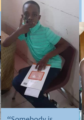
"Somebody is happy to receive tennis shoes."