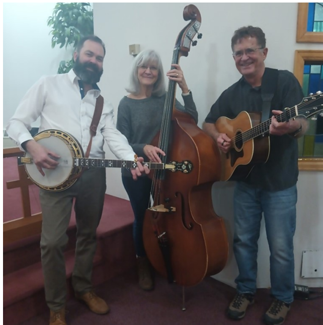
Lighthouse Trio February 11, 1016