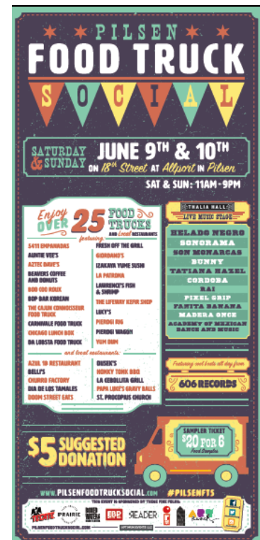
Half Page Red Eye Ad