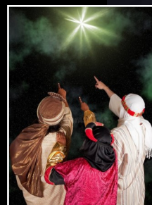
JUPITER King Planet Planet of he Messiah

December 25, -2 BC 15 Months from Birth on September 11, -3 BC Worship of the 'Man-Child' Messiah of Israel.