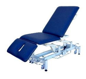
3-Section Hi/Lo Table