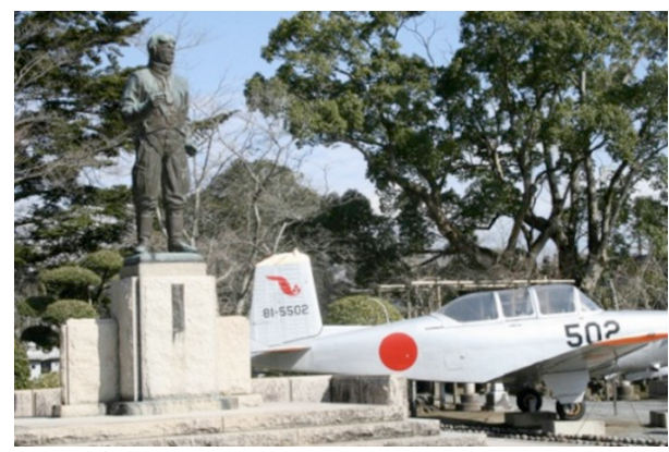
A statue glorifying the kamikaze special forces is located at the Chiran Peace

Mercy, who is said to turn nightmares into pleasant dreams. Also present are shrines dedicated to patriots and memorial stones erected for the different "graduating classes" by surviving classmates. Listed among the names of those erecting monuments are Koizumi Junichiro, the man who insisted on worshipping at the Yasukuni Shrine while serving as prime minister and Ishihara Shintaro, the current Mayor of Tokyo who has not shied away from making extreme right-wing remarks.