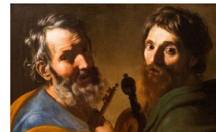
Feast Day: October 25