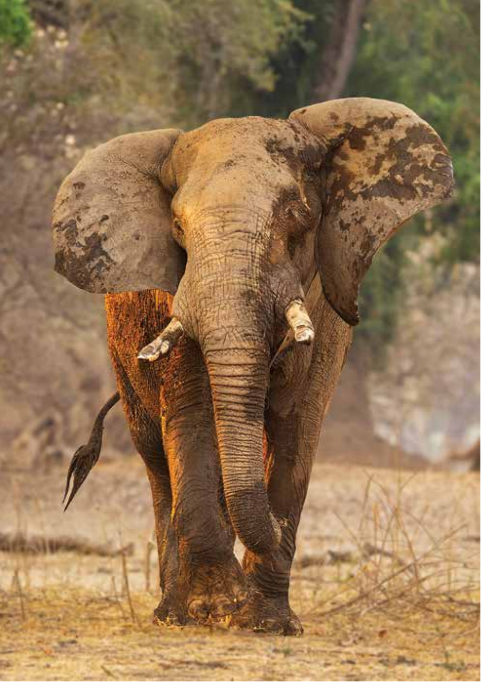
Elephant with Broken Tusks Approaches