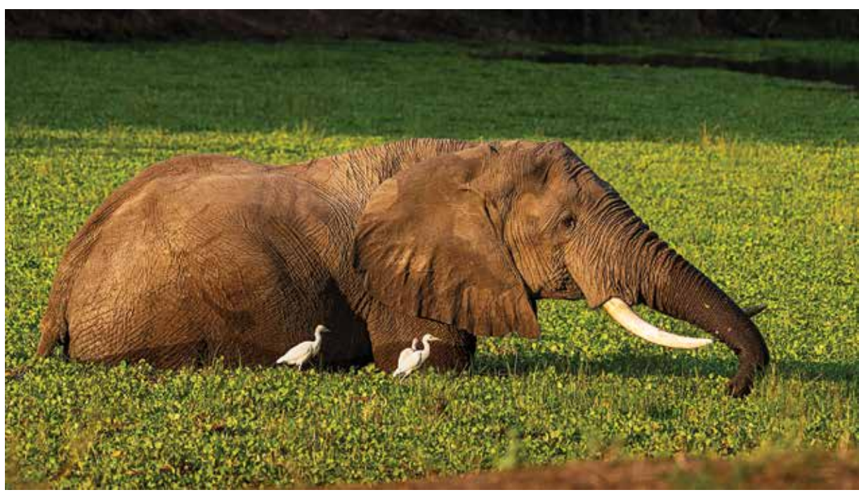
Tusker Hangs in Marsh with Egrets