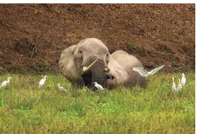
Elephant Stands in Marsh with Eight Egrets

Their favorite tree appears to be one known locally as "sausage" trees due to the phallic-looking fruit that hangs ubiquitously and is a preferred food source for baboons and other species. But the elephants prefer the green limbs rather than the fruit. This, and the lack of grass or scrub during the dry season, are what prompt the famous behavior. While there, we were also privileged to photograph a pack of African Wild Dogs playing and devouring an impala. We had a brief encounter with a small group of lions, and photographed a group of vultures so thick you could not see what they were eating (it was what the lions had killed the night before). Cape buffalo, hippos, baboons, bee-eaters, kites, and many other African animals attracted our attention as well. But the elephants are the main attraction, and made the whole trip worthwhile.