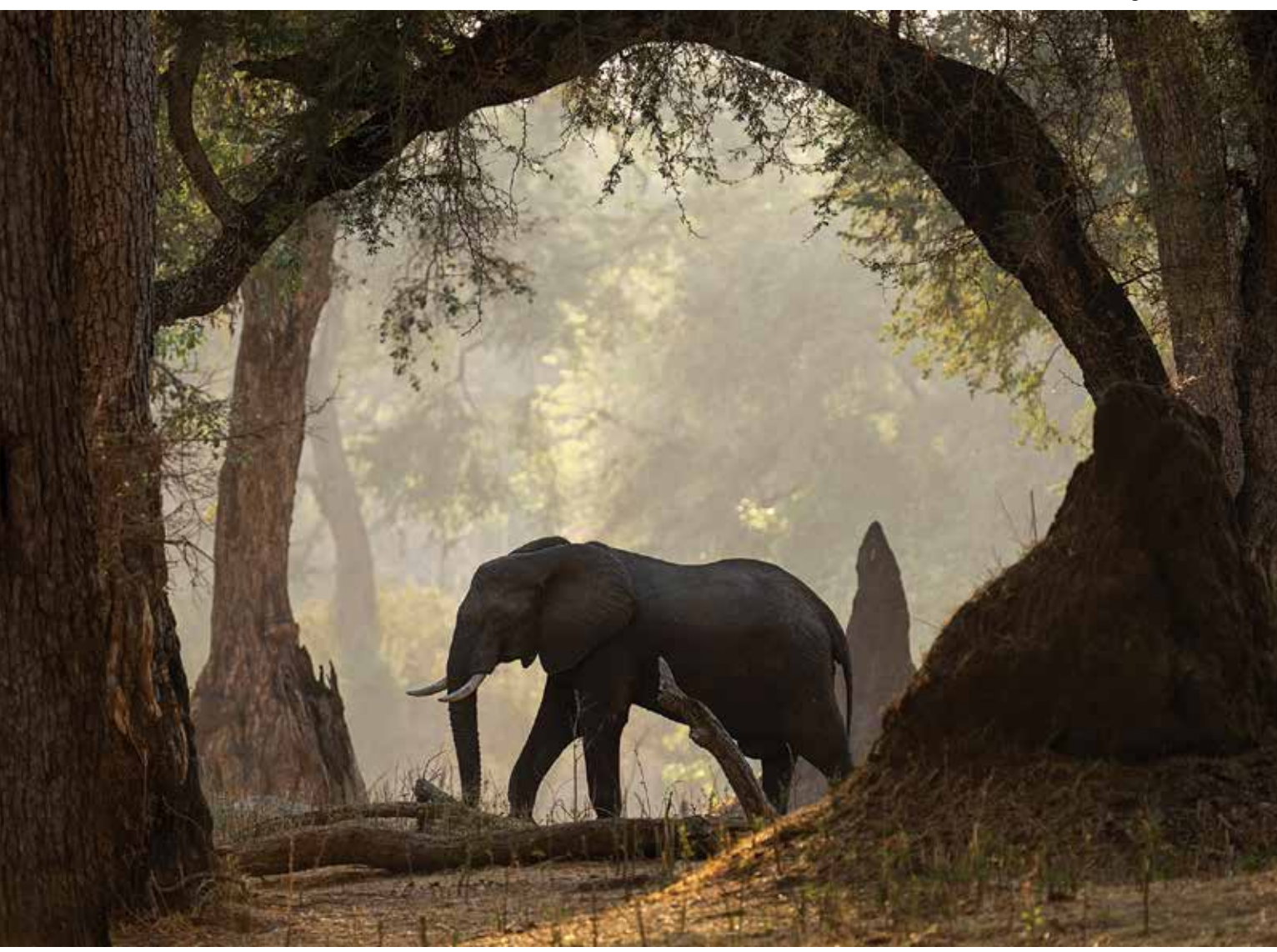
Tusker Strolls Through Forest