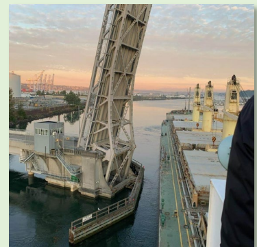
Passing through the 11th St bridge in the Hylebos Waterway.