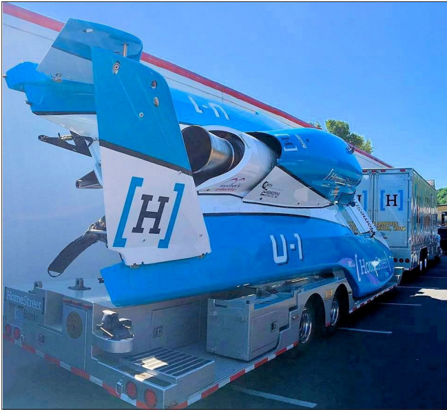
Miss Madison Race Team

The U-1 came out west early to the HomeStreet Racing shop in Tukwila (below left) for some engine work and display duty before heading back over the mountains to the Tri-Cities for the HAPO Columbia Cup. Below right, the boat heads across the plains going west.