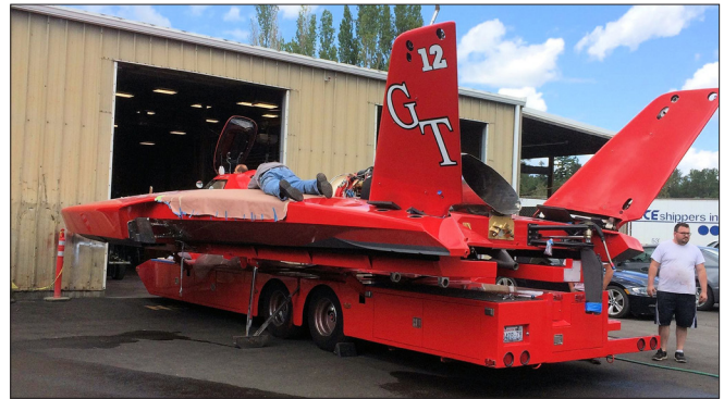
Graham Trucking Racing