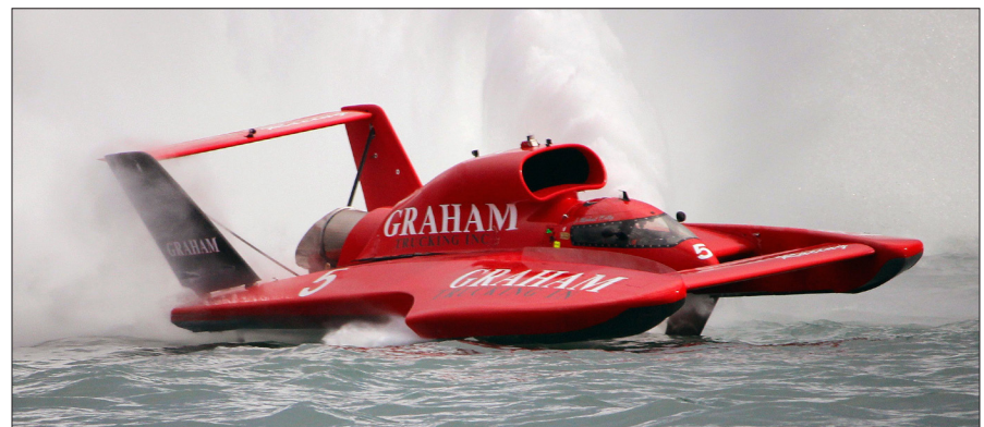
The Graham Trucking while on its way to victory in last year's Gold Cup.