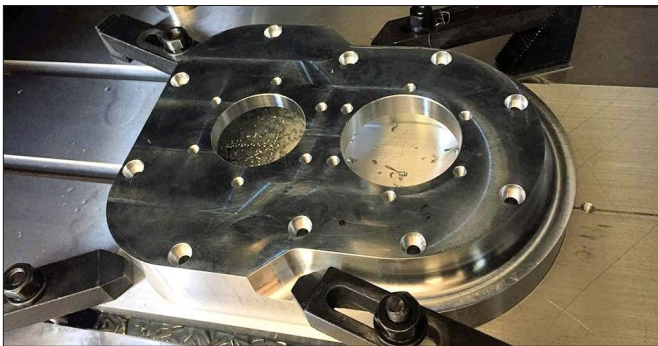
Bucket List Racing

Work continues at the Bucket List Racing team, developing an improved gearbox case (pictured below) and system to work with the T-53 turbine.