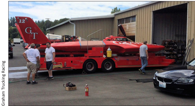
Graham Trucking Racing

The Graham Trucking team has been busy with all the final preparations and testing systems, in advance of their debut in Tri-Cities with the updated U-12 hull. Here's the boat outside of its shop in Milton, Washington.