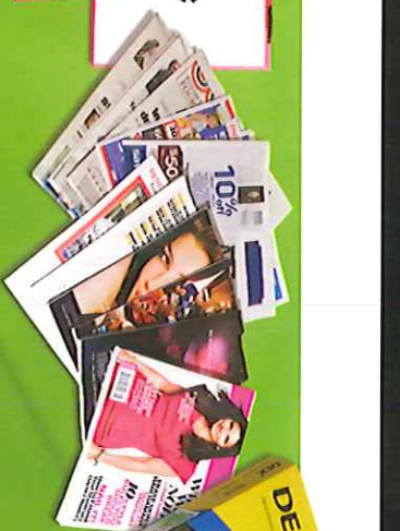
Newspapers and inserts, magazines, brochures, and catalogs