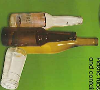
Glass bottles and jars