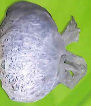
Shredded paper (please place in clear plastic bags)