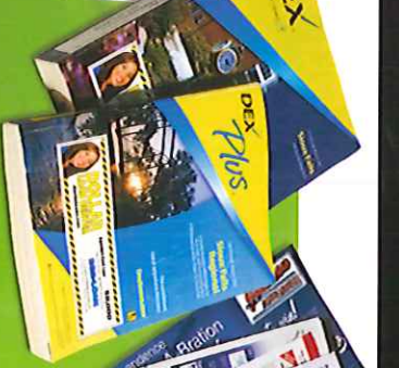
Phone books (no more than 2 books per pick-up, per resident)