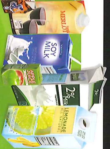
Cartons (please empty of all liquids)