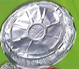
Clean aluminum trays and balled foil (3" or larger)