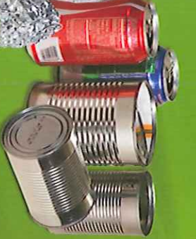
Aluminum and steel cans (do not flatten or crush)