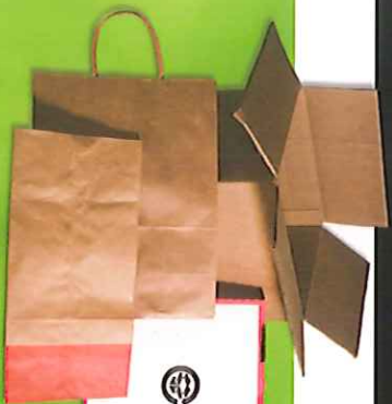
Flattened corrugated cardboard & brown paper bags