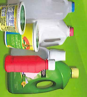
Plastic tubs, jugs and containers