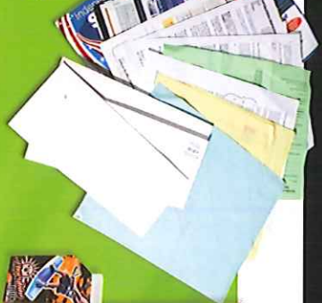
Office papers and junk mail