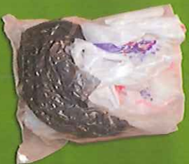
Plastic bags (please place in a clear plastic bag)