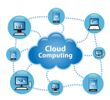
Figure 1. Cloud Computing Model

computing, the software programs one use are not run from one's personal computer, but are quite stored on servers accessed via the Internet. If a computer crashes, the software is still available for others to use. Similar goes for the documents one create; they are stored on a collection of servers accessed through the Internet. Anyone with permission can not only access the documents, but can also edit and cooperate on those documents in real time.