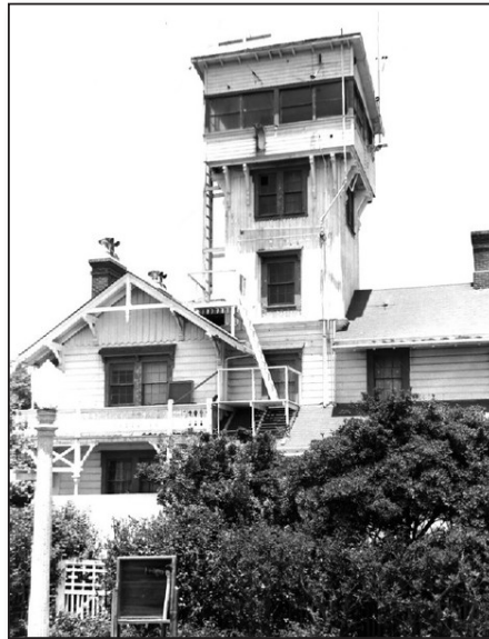
COVER PHOTO: "What is this?" you might ask... "And how does it relate to this issue?" Well, you're about to find out...