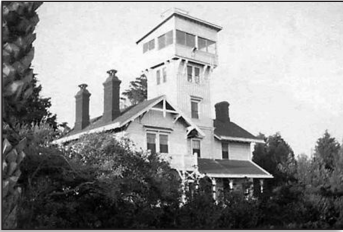
Another photograph of the lighthouse from a different angle before its 1974 restoration.