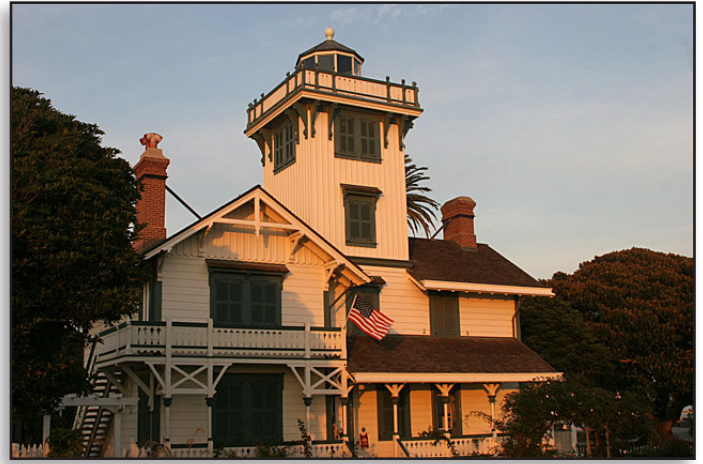
The restored Point Fermin lighthouse as it looks today.