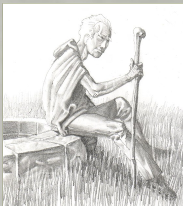
Wong appears in the book The Door to Sambucca as a wandering spirit He quickly makes friends with Nathan, the protagonist, and Nathan finds out that Wong is from the martial arts temple that Nathan trained at years ago. Wong agrees to train Nathan for his resolution to his delusions, and in doing so he asks Nathan many questions. The most famous of these is, "If we truly loved one another, would we really need laws?"

The Pharisees had a law when Jesus came to be crucified. Their law said that one could do no work on the Sabbath day and they used this one law to the extent of persecuting Jesus for healing a man on the Sabbath. Here is what Jesus said about the Pharisees complaining about Him healing the man with the withered hand: Is it