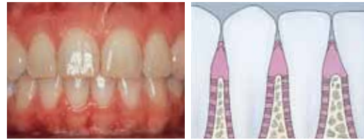
Healthy gums and bone anchor teeth firmly in place.