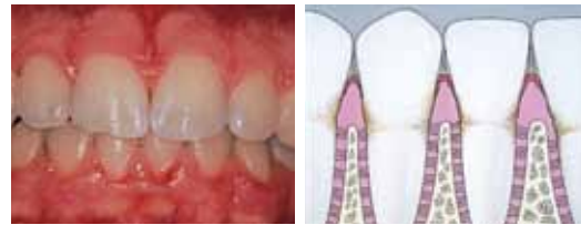
Gingivitis develops as bacterial toxins irritate the gums, making them red, tender, swollen and likely to bleed.