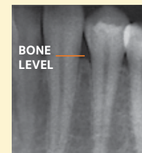
X-ray showing supporting bone