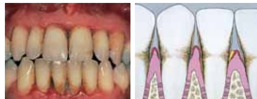
Periodontitis occurs when inflammation caused by bacteria leads to destruction of the tissues. Unless treated, the affected teeth may become loose and even require removal by a dentist.