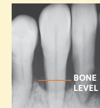
X-ray showing periodontal bone loss