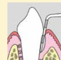
Periodontal probe in a periodontal pocket