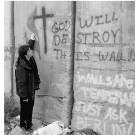
The UMC Cross and Flame painted on the Separation Wall in Palestine. The words on the wall read: "God will destroy this wall" and "Walls are temporary, just ask Berlin!"

For decades, Christians living in the Holy Land have endured a harsh military occupation that has become an apartheid regime. In December 2009, they issued a powerful call to the global Church - to take concrete action to help them regain their freedom - in Kairos Palestine: A Moment of Truth . Drawing upon the legacy of the South African Kairos Document , endorsed by the Patriarchs and Heads of Churches in Palestine, and inspired by God's grace and love, Kairos Palestine is a profound statement of faith, a vivid description of life under occupation, and a call to action for Christians everywhere - to help bring freedom, equality, and a lasting peace to all the people of Israel and Palestine. In their own words, excerpts from Kairos Palestine : "The Israeli occupation is an evil and a sin that must be resisted and removed...love puts an end to evil by walking in the ways of justice....Taking action to end the oppression is not working against Israel....It will benefit both peoples, when justice and the peace that comes from that are secured for all the people of the Holy Land....Our word to the churches of the world is a call to stand alongside the oppressed....Our question to our brothers and sisters in the Churches is: Are you able to help us get our freedom back, for that is the only way you can help the two peoples attain justice, peace, security, and love."