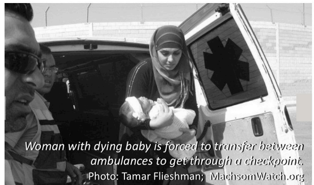
Woman with dying baby is forced to transfer between ambulances to get through a checkpoint.

Interminable delays at checkpoints make normal life impossible. Driving a few kilometers in occupied territory often takes hours, strangling the Palestinian economy and affecting every facet of life.