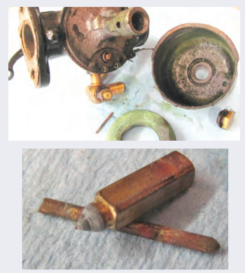
Storing gasoline in the carburetor bowl will result in residue accumulating in the bowl, as shown in the top picture. The Vitron tip float needle was stuck due to tainted fuel, which caused the plastic tip to adhere to the seat of the float needle valve and resulted in a leaking carburetor at start up.

to prevent the development of tainted gas. By draining gas out of the carburetor, the float needle and float stay in good condition. Place a note on the dash to remind you to close the drain valve prior to opening the gas tank!